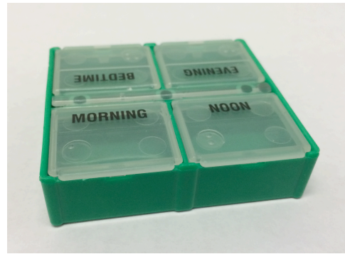
Figure 4. Pill Box Used in the Hopkins Medical Schedule