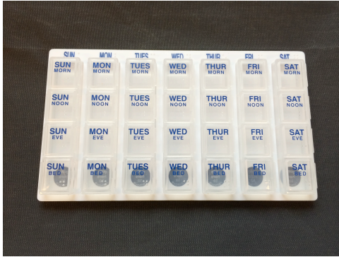
Figure 3. Pill Box Used in the Self-Medication Task.